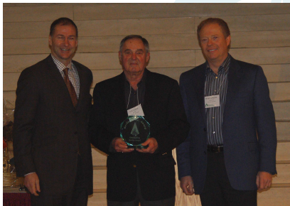
(l) Kevin Lowe, Honorary Chair and (r) Brian Gingras, Chair, Volunteer Committee congratulate recipient (c) Eric Cooke.