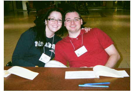
Donation Desk at Southgate Shopping Centre.

"I would like to thank everyone at the Christmas Bureau ... Thank you for your time and kindness and support to the people who need to be reminded that we still exist and there is hope. Have a wonderful year and take a moment to remind yourself that you are appreciated."